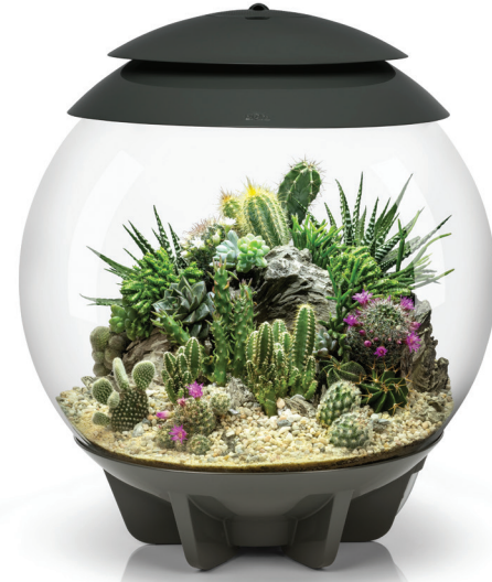
Semi-Arid climate For keeping Cacti and succulents