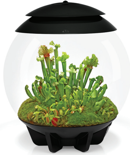
Medium climate For keeping temperate plants