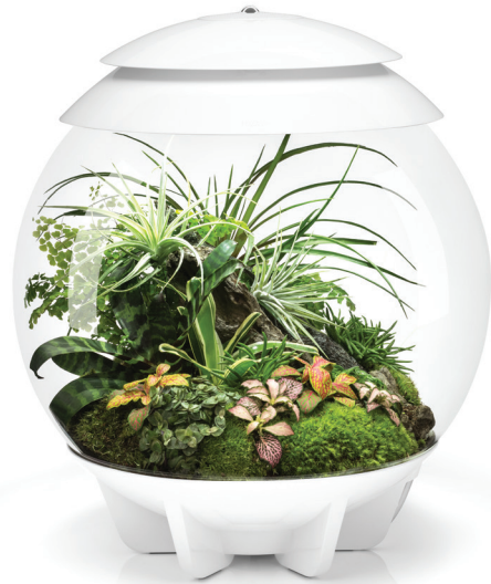
Tropical climate For keeping tropical plants that like high humidity

The AIR 30 goes beyond its predecessor, offering more climate and lighting options. Grow plants in a tropical, moderate or semi-arid environment.