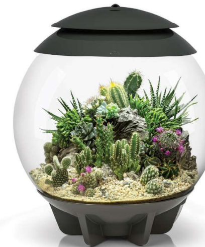
Semi-Arid climate For keeping Cacti and succulents