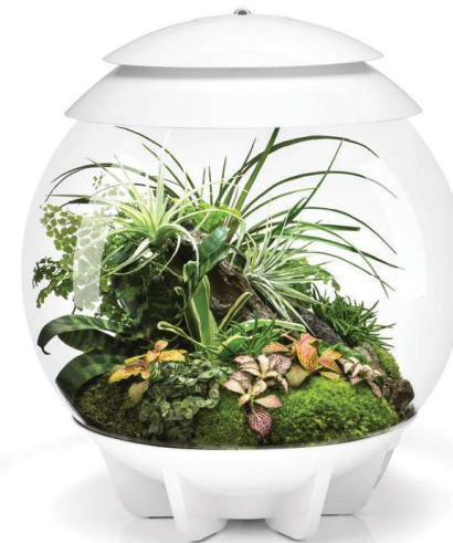
Tropical climate For keeping tropical plants that like high humidity

The AIR 30 goes beyond its predecessor, offering more climate and lighting options. Grow plants in a tropical, moderate or semi-arid environment. See P.25 for a list of plants that work well in the AIR 30.