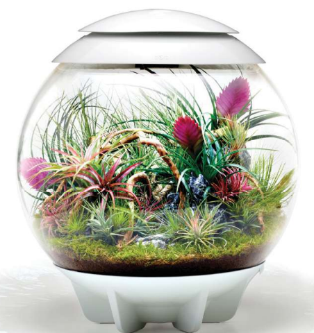
High setting For a jungle environment with many plants