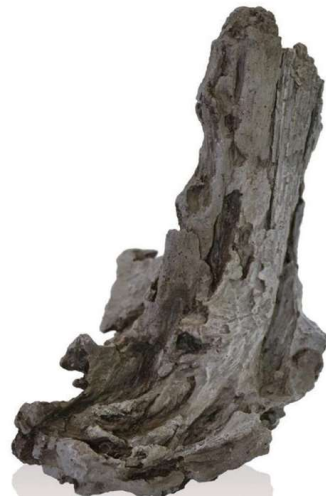
46159 Rockwood spire sculpture