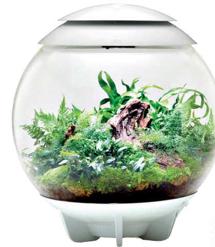
Low setting For a less humid environment and light planting

The AIR 60 replicates the natural conditions found under the tropical forest canopy. There are 3 misting and fan settings. See P.25 for a list of plants that work well in the AIR 60.