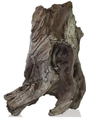
46161 Rockwood neck sculpture

These inert resin sculptures are beautiful replicas of naturally occurring bog-wood and Petrified wood. All sculptures are plant and animal friendly. See P.24 for sizing chart Limited availability.