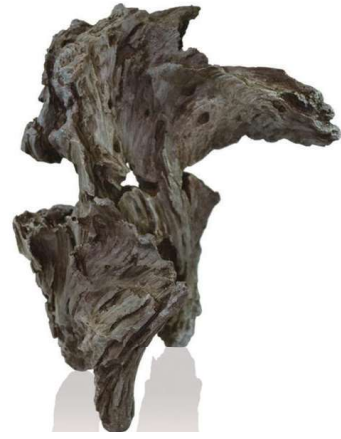
46160 Rockwood bird sculpture