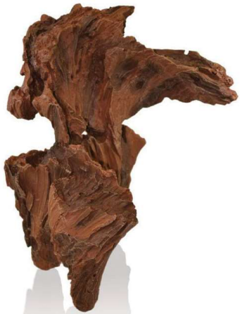
46158 Bogwood bird sculpture