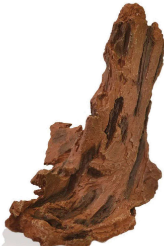
46157 Bogwood spire sculpture