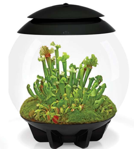
Moderate climate A medium setting for keeping temperate plants