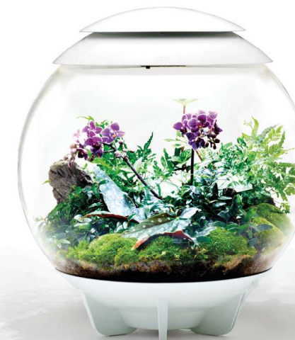
Automatic setting For moderate planting