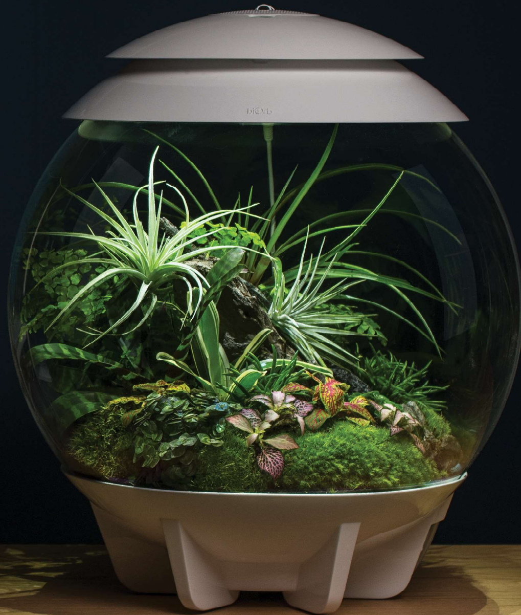
biOrb AIR 30 white

We decided we just couldn't stop at aquariums. Our next idea was to bring the same design philosophy of 'functional beauty' to the world of terrariums. The result - the biOrb AIR, an innovative terrarium with automated functions for hassle-free plant care.