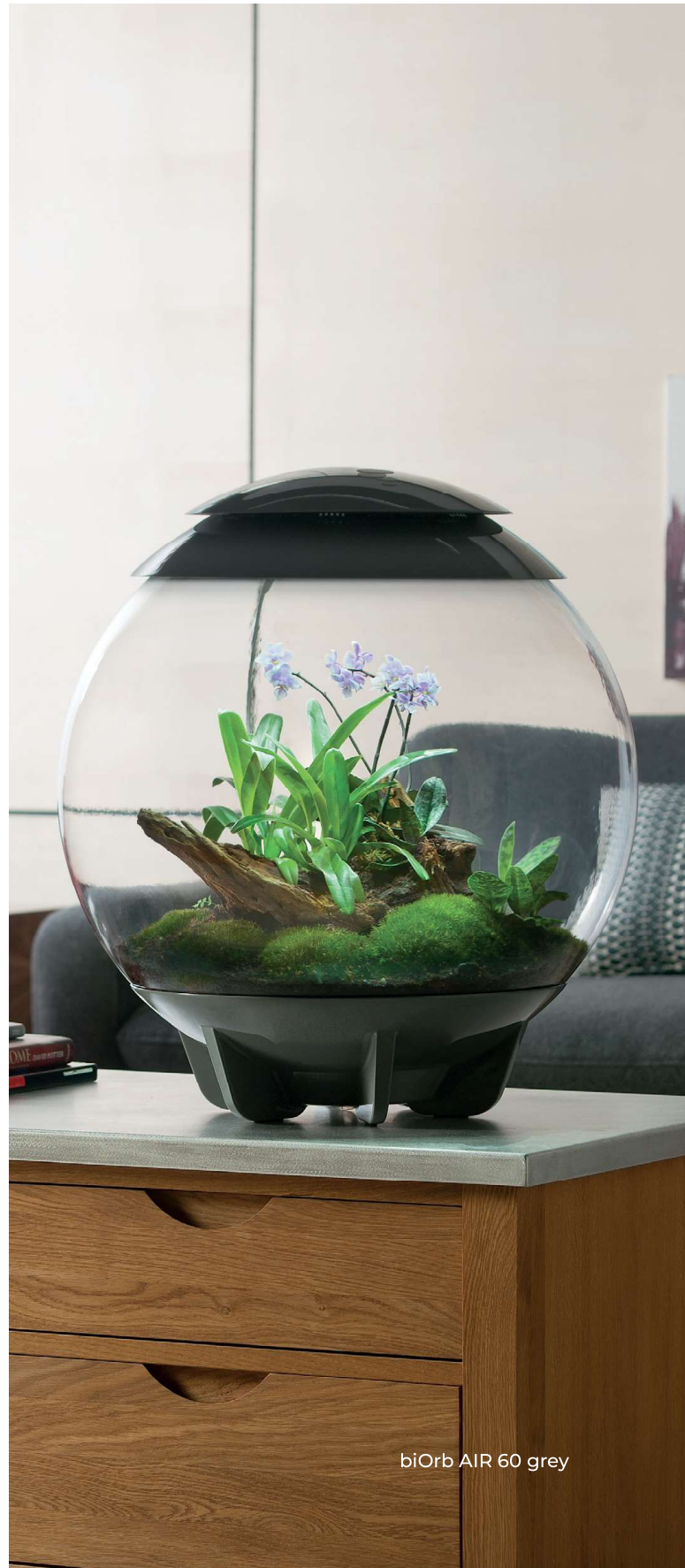
biOrb AIR 60 grey