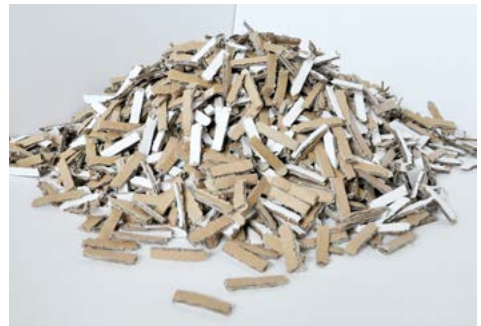
pourable chips 8x40-200mm