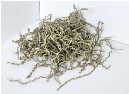
stripes 4mm DIN66399/1-2

Give your waste cardboard a second life!