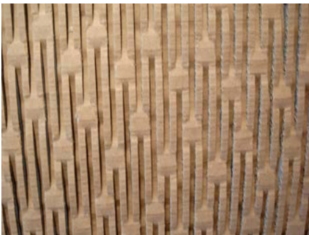
flat padding mats