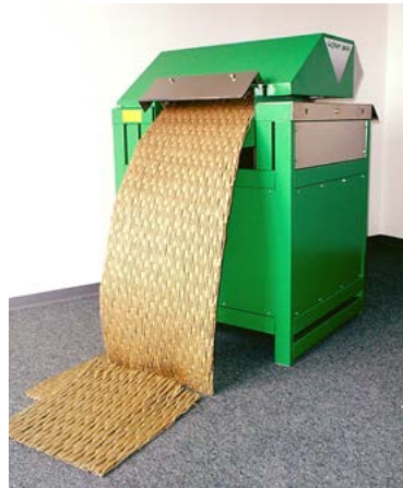
flat padding mats