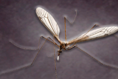
European Crane Fly