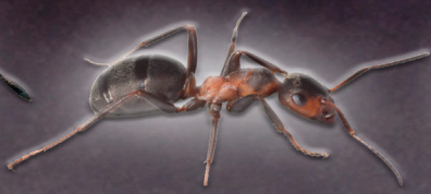
Ants (Except Carpenter, Red Imported Fire Ant and Pharaoh)