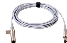
SC 91A Microphone Extension Cable