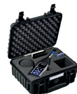
SA 72 Waterproof carrying case