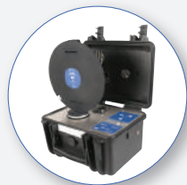
SV 111 Hand-Arm and Whole-Body Vibration Calibrator