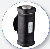
SV 110 Hand-Arm Vibration Calibrator