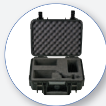
SA 76 Waterproof Carrying Case