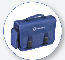
SA 47M Carrying Bag Fabric Material