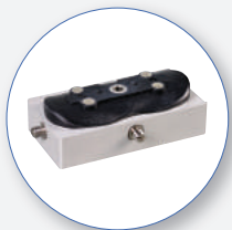
SA 105 Calibration Adapter to SV107