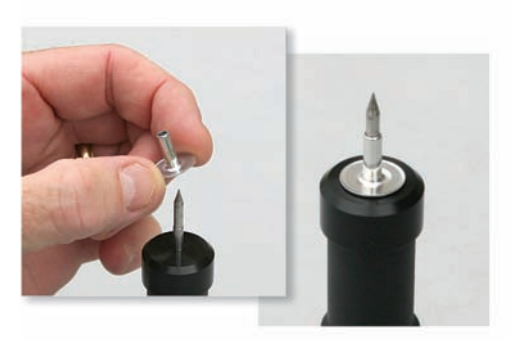
Step 1: Load a sample probe onto the piercing tool.

PortaCount Pro+ Fit Tester supplied with the same tool set that comes with the 8025-N95 Probe Kit and 100\ probes .