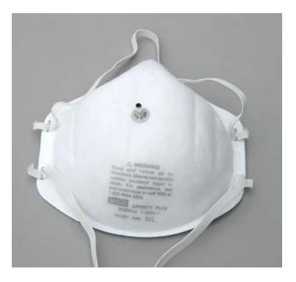
The respirator is now ready for fit testing.