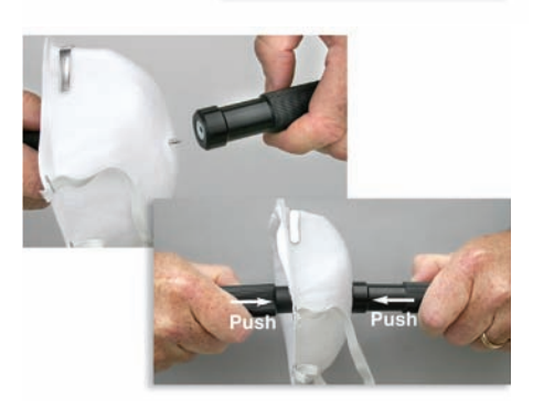
Step 4: On the outside of the respirator, align the push nut tool over the end of the exposed point. Hold the tools in-line with each other and firmly push them together as far as possible.

Step 3: Use the piercing tool to puncture the respirator from the inside. Push the point through far enough to be seen from the other side.