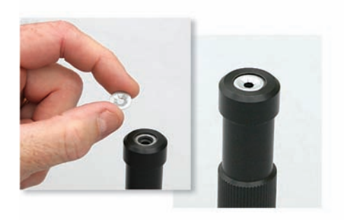
Step 2: Load a push nut onto the magnetic push nut tool.