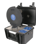
SV 111 Hand-Arm and Whole-Body Vibration Calibrator