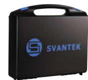
SA 146 Carrying Case for SV 106A and accessories