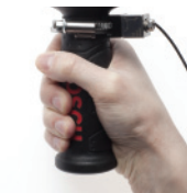
SV 150 Tri-Axial Hand-Arm Vibration MEMS Accelerometer