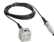
SV 151 Tri-Axial SEAT Vibration MEMS Accelerometer