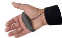
SV 105F Tri-Axial Hand-Arm Vibration Accelerometer with Force Detection