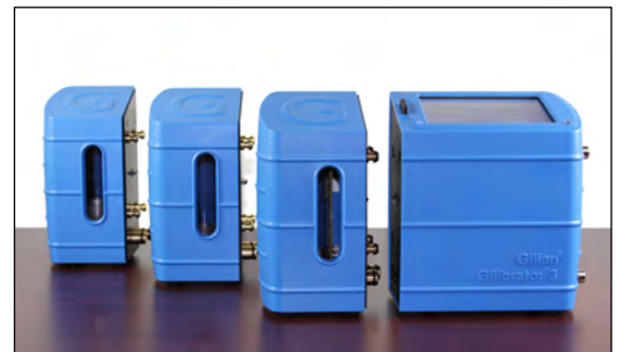
High, standard, & low flow cell modules are easily interchanged

The Gilibrator 3 can be configured to meet the user's calibration needs. The user may select between Continuous or Averaging modes. In Averaging mode, the user may select a sample set between 3 and 20 samples to be averaged. In addition, the user can define statistical parameters for 95% confidence level of averaged samples. Within the settings screen, the user is able to define engineering units of measurement, date, time, temperature, and choose from a selection of languages in the devices library.