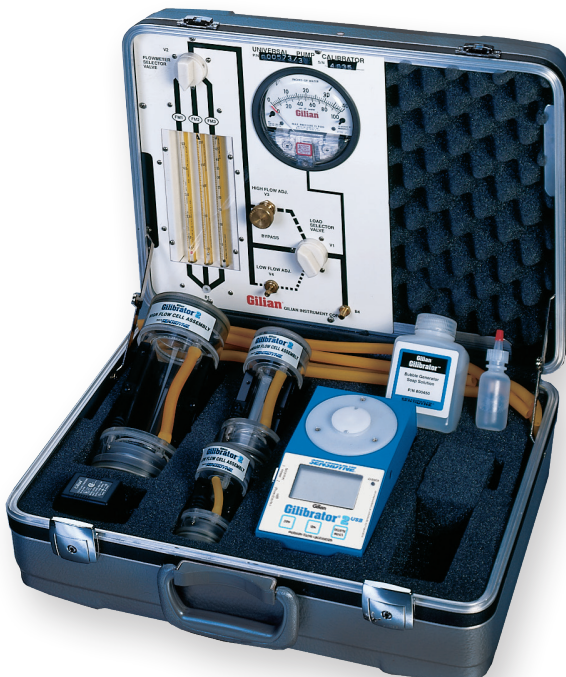
Deluxe Diagnostic Kit