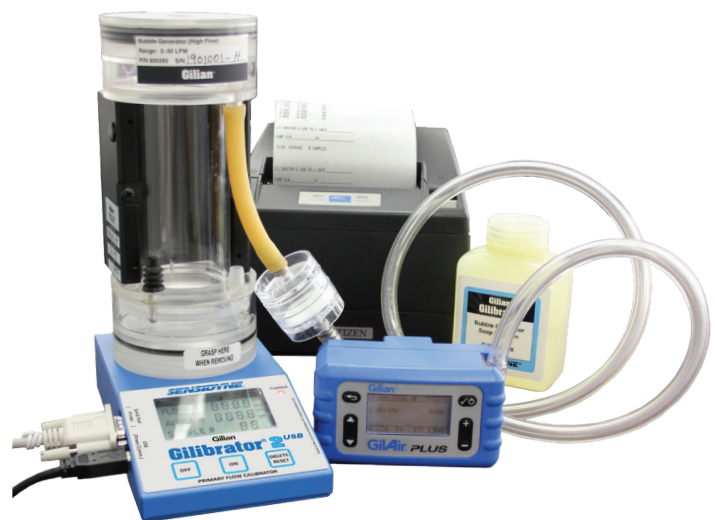
Gilibrator 2 USB shown calibrating the GilAir Plus air sampling pump, with optional Printer Kit and Bubble Soap Solution.