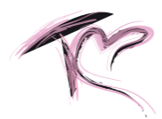
Thorne Mason Trust

The social media hashtag for the meeting is #APPGBT. Briefing and Minutes of the meeting will be available at: www.braintumourresearch.org/campaigning/appg-on-brain-tumours