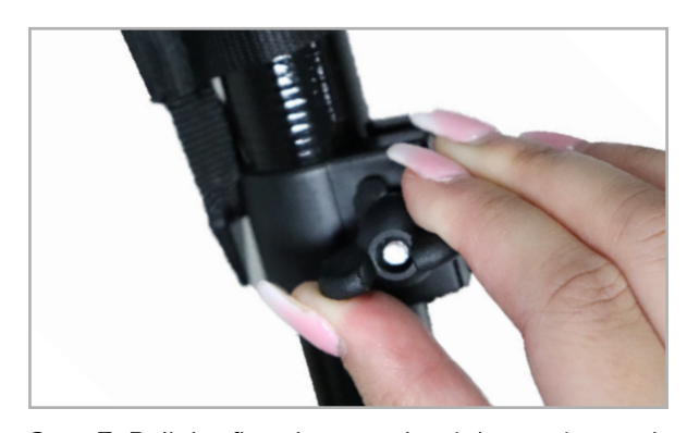
Step 5: Pull the flag down to the right tension and twist the butterfly screw to secure the lock in place.