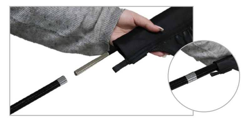
Step 3: Once you have fully inserted the thinnest pole, connect the middle poles and continue feeding the poles through the sleeve. Repeat this process for the remaining pole.