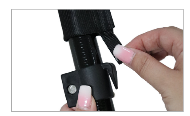
Step 4: Loosen the butterfly screw allowing you to move the locking mechanism closer to the bottom of your flag. Then take the fabric loop and attach to the lock hook.