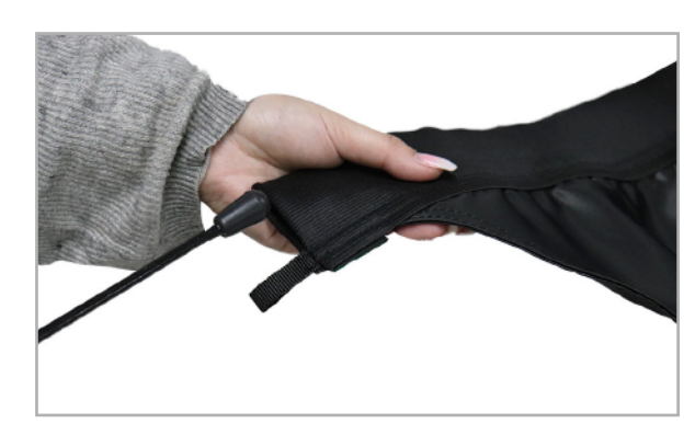
Step 2: Take the thinnest pole and begin to feed it through the sleeve of your Feather Flag, starting from the bottom.