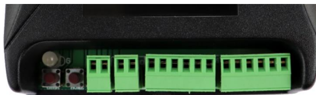
| HOME Button Memory Height Button