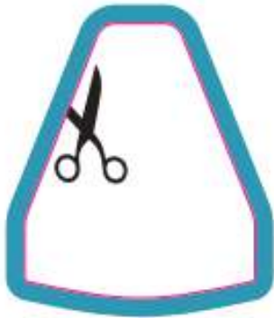
ESON & ESON 2 SMALL