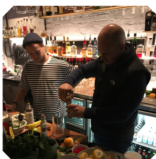
Cocktail Making Workshop, Hawker Bar