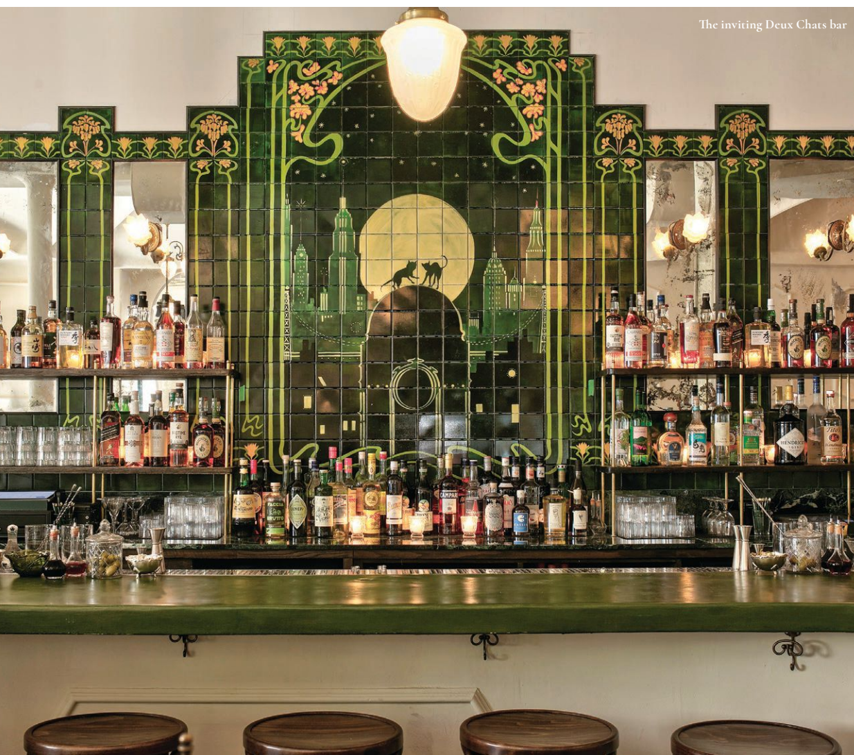
The inviting Deux Chats bar