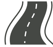
Access Routes and Temporary Car Parks