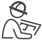
Civil Engineering /Infrastructure