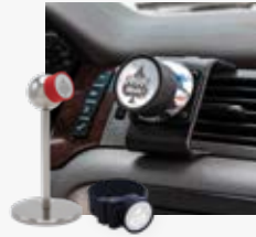
connect to even more...

The magnetic iOcore™ (the powerhouse in this system) is available in multiple colors.