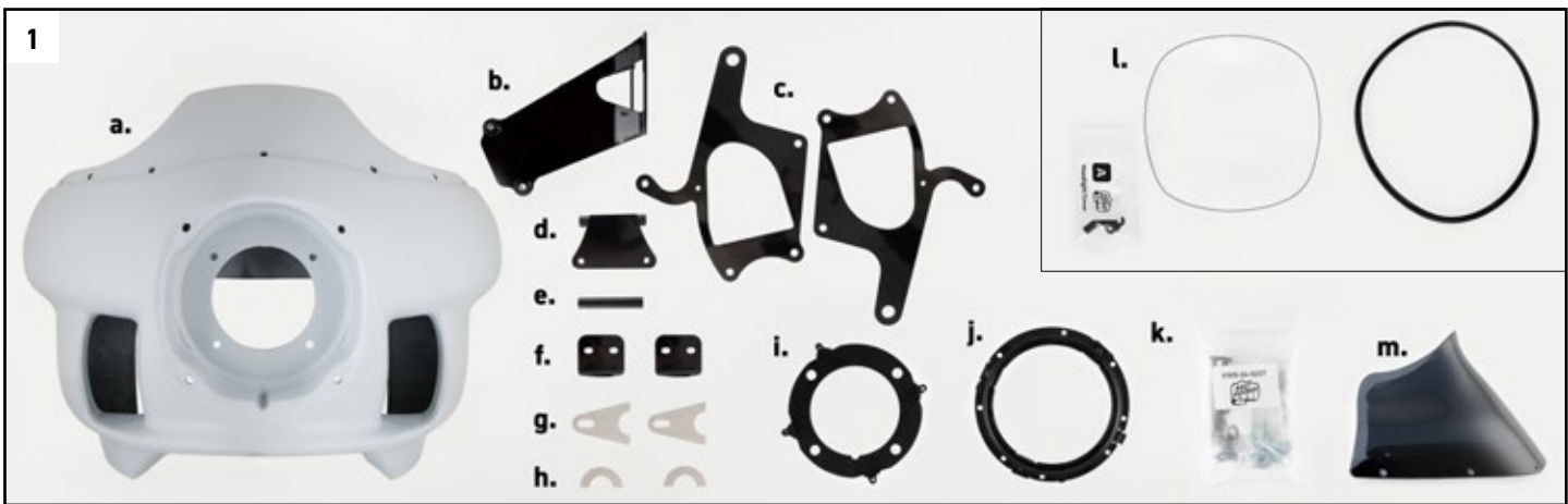
FXRP Fairing Fit Kit Instructions