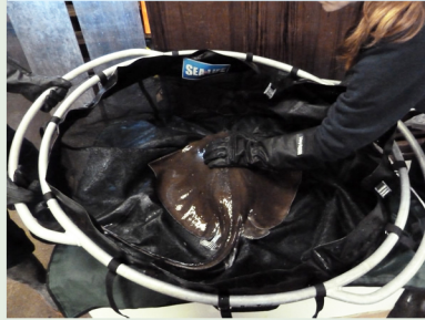
Small Stingrays @ Sealife