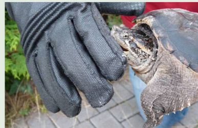
Snapping Turtle (private keeper)