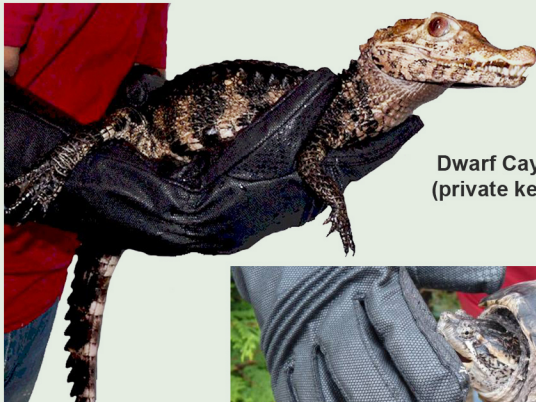
Dwarf Cayman (private keeper)