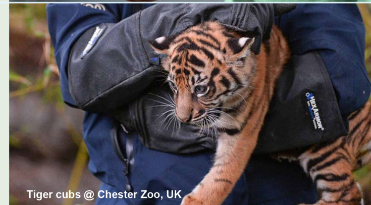
Tiger cubs @ Chester Zoo, UK