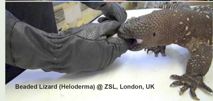
Beaded Lizard ( Heloderma ) @ ZSL, London, UK