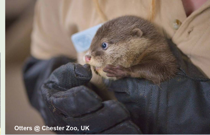
Otters @ Chester Zoo, UK