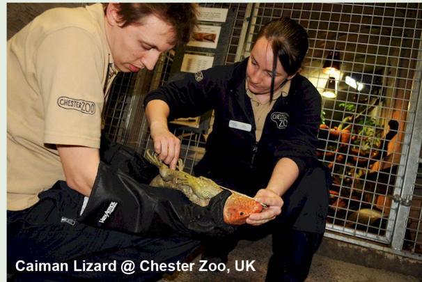
Caiman Lizard @ Chester Zoo, UK