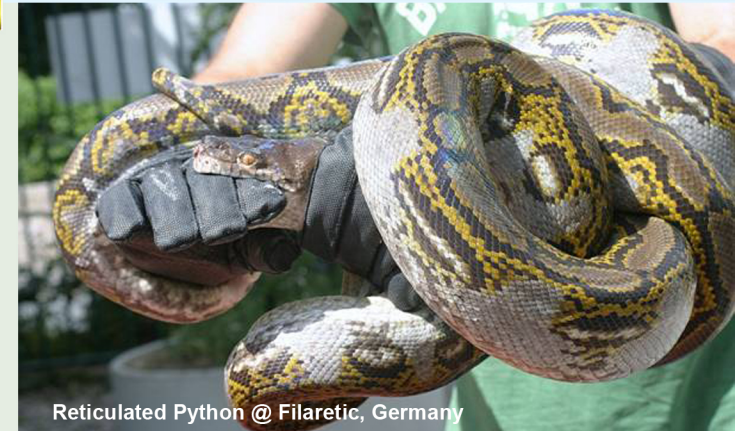
Reticulated Python @ Filaretic, Germany