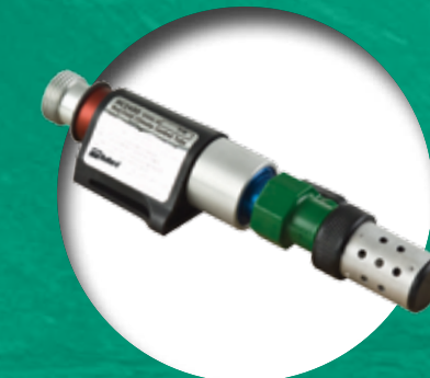
HC2400 Hot/Cold Tube