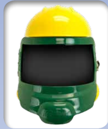
.040" Smoke Tinted Outer Lens