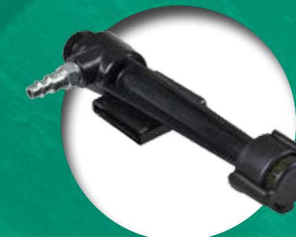
CT Cool Tube