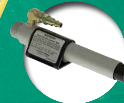
AC1000 Cool Tube