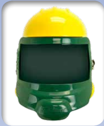
.040" Green Tinted Outer Lens