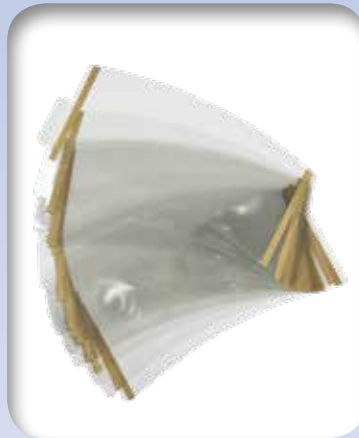
Adhesive-Backed Mylar® Lens Covers