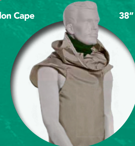
38" Length "Golden Gate" Nylon Cape