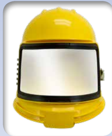
.040" Clear Inner Lens