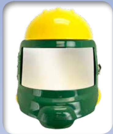
Clear Outer Lens Available in .015" or .040"