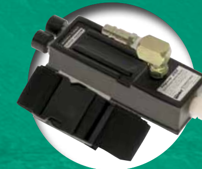
Frigitron 2000 (For use with Bullard Ambient Air Pumps)