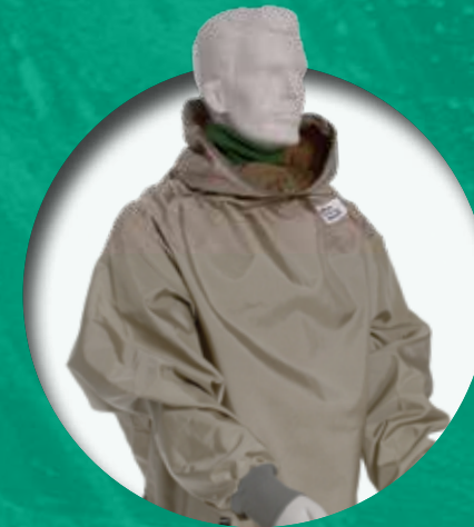
38" Length Hibernia Parka