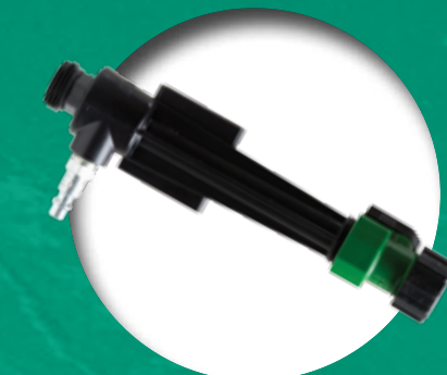
HCT Hot/Cold Tube