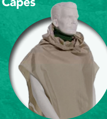
28" / 38" Length Nylon Cape