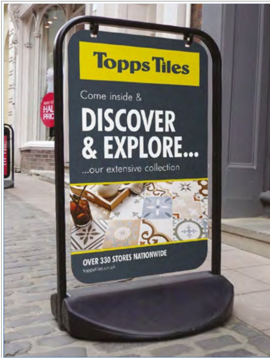
With black frame and base