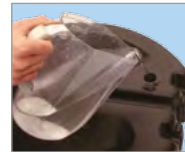
Water-fillable bases for optimum stability