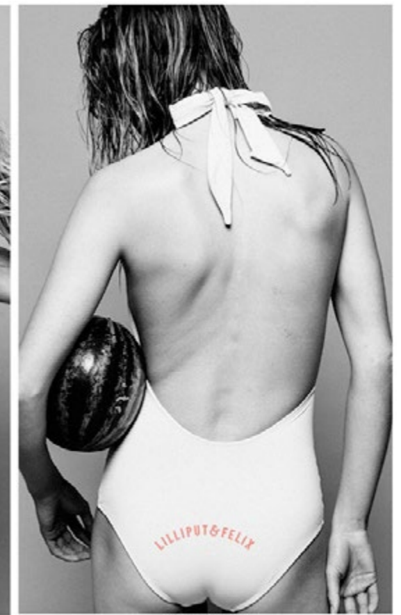
Lilliput & Felix