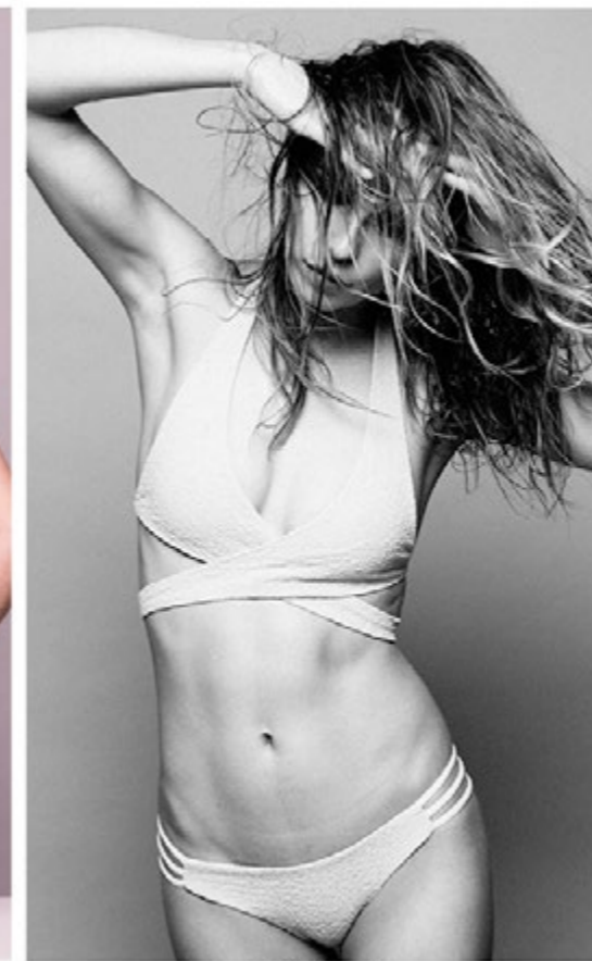
Lilliput & Felix