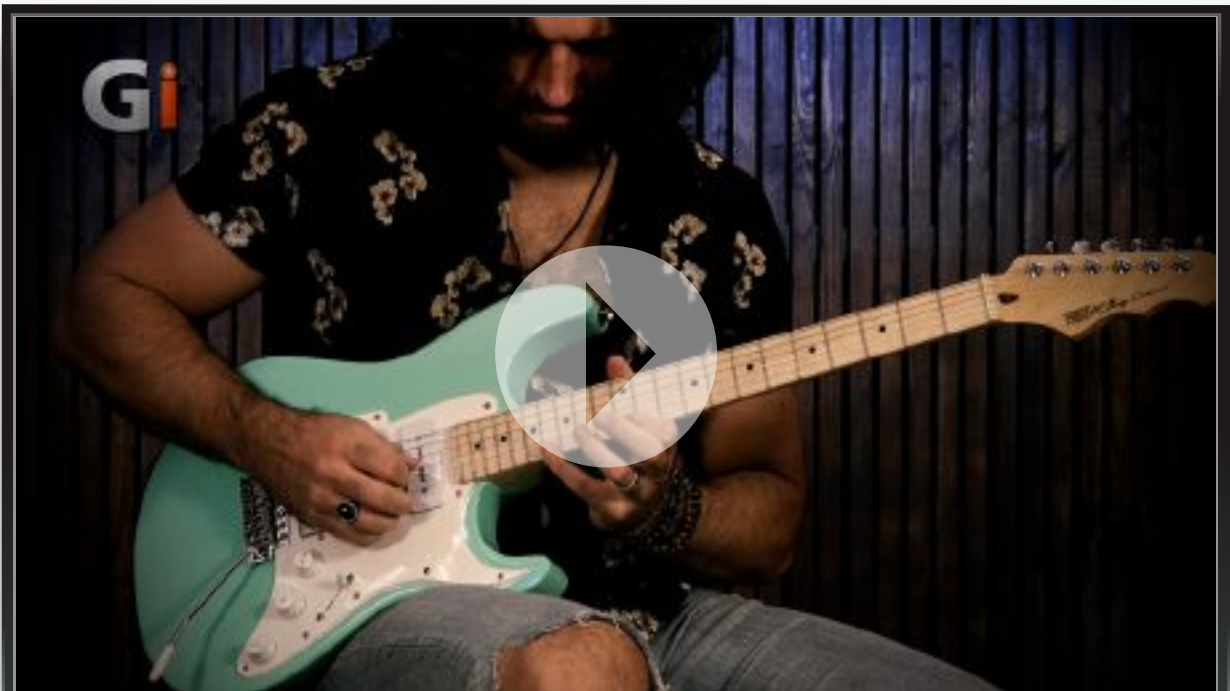
Fret King Corona Custom

THERE is a lot to be learned by observing the guitars used by pro players. I'm not talking about treasured vintage classics or flashy signature models, but the workhorse axes used by seasoned road warriors on sessions, sit-ins and sideman gigs all across the globe. Look closely and you'll find timeless designs, but with countless clever and functional modifications to improve the important "-ities": reliability, playability and versatility.