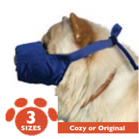
Short-Snouted Red or Royal Blue

USE ONLY UNDER DIRECT S PERVISION. NEVER LEAVE A MUZZLED ANIMAL UNATTENDED. Please see important usage and sizing chart on reverse side.