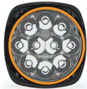
Zone #3 Perimeter LED's only