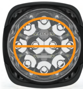
Zone #1 & #2 All projection LED's