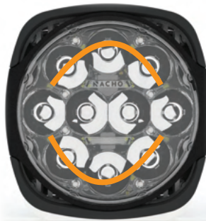
Zone #2 Top & Bottom 6 LED's only