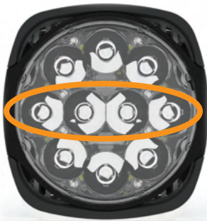
Zone #1 Middle 4 LED's only