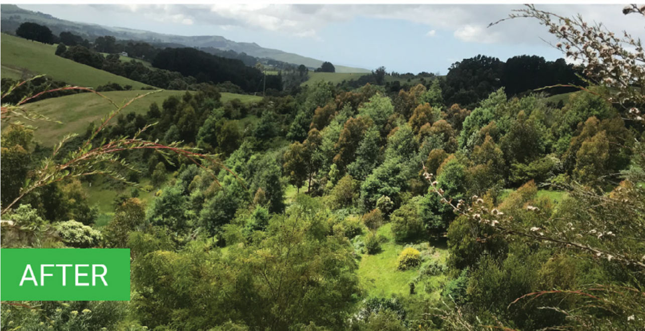
The restoration of our forest called Whitehurst on Boon Wurrung Country in Gippsland, Victoria.