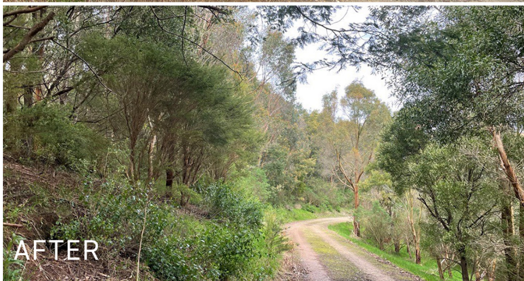
The transformation of our forest at Battery Creek on Boon Wurrung Country in Gippsland, Victoria. Revegetated between 1999 and 2009, the second photo was taken on a site visit in 2022.