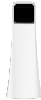
Large Tip (Set of 2) $80.00