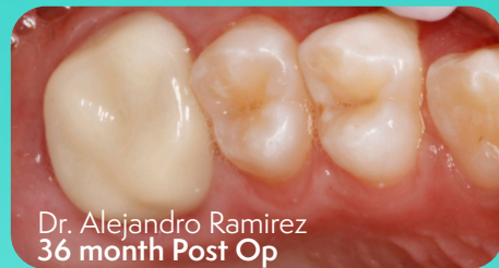
Dr. Alejandro Ramirez 36 month Post Op

NuSmile's new Permanent Molar Crowns were created with the purpose of providing an esthetic, full-coverage solution to using stainless steel crowns for Early Childhood and Adolescent Tooth Decay and Molar Incisor Hypomineralization/Hypoplasia (MIH). Now your patients can have an esthetically pleasing option that allows them to smile with confidence. These crowns are built to last throughout their developmental stages of life from early childhood to growing up as young adults.