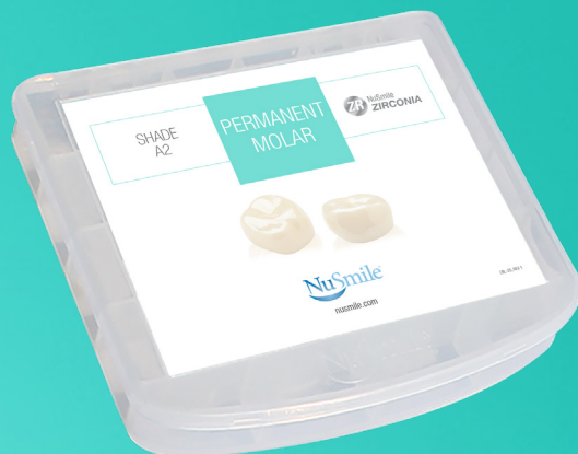
PERMANENT MOLAR KITS