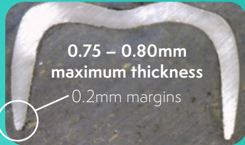
Thin margins and minimal overall thickness for less tooth reduction

Intaglio surface mimics sandblasting, providing maximum surface area and mechanical retention for cement adhesion with any cement.