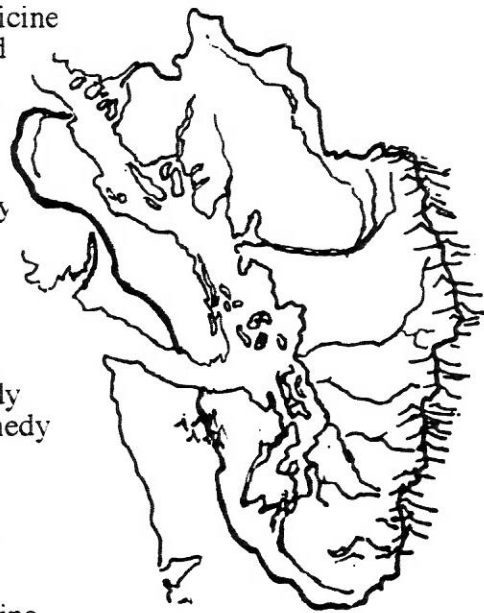
The Ish River Bioregion Puget Sound & Straits of Georgia watersheds.

Diaphoretic Dietary Aid Disinfectant Diuretic Ear Medicine Emetic Expectorant Eye medicine Febrifuge Gastrointestinal Aid Gland Medicine Gynecological Aid Hallucinogen Heart Medicine Hemorrhoid Remedy Hemostat Herbal Steam Hunting Medicine Hypotensive Internal Medicine Kidney Aid Laxative Liver Aid Love Medicine Miscellaneous Disease Remedy Narcotic Nose Medicine Oral Aid Orthopedic Aid Other Panacea Pediatric Aid Poison Poultice Preventative Medicine Psychological Aid Pulmonary Aid Reproductive Aid Respiratory Aid Sedative Snakebite Remedy Sports Medicine Stimulant Strengthener Throat Aid Tonic Toothache Remedy Tuberculosis Remedy Unspecified Urinary Aid Venereal Aid Vertigo Medicine Veterinary Aid Witchcraft Medicine