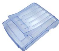
Spill proof cover