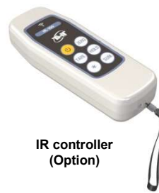
IR controller (Option)