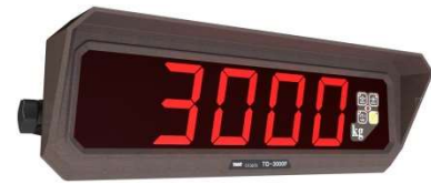
TD-2300F / 3000F