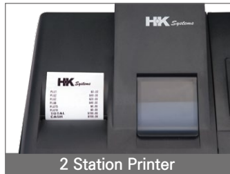
2 Station Printer