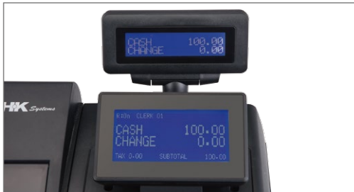
Operator & Customer Display