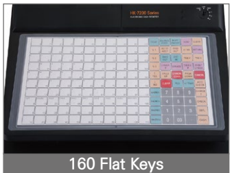
160 Flat Keys