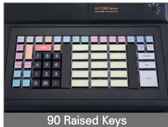
90 Raised Keys