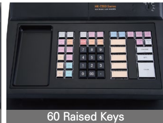
60 Raised Keys