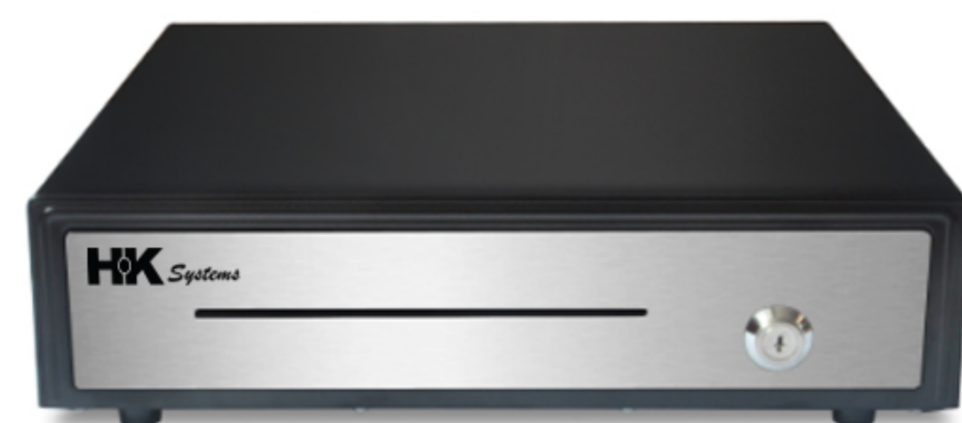
Stainless steel front panel