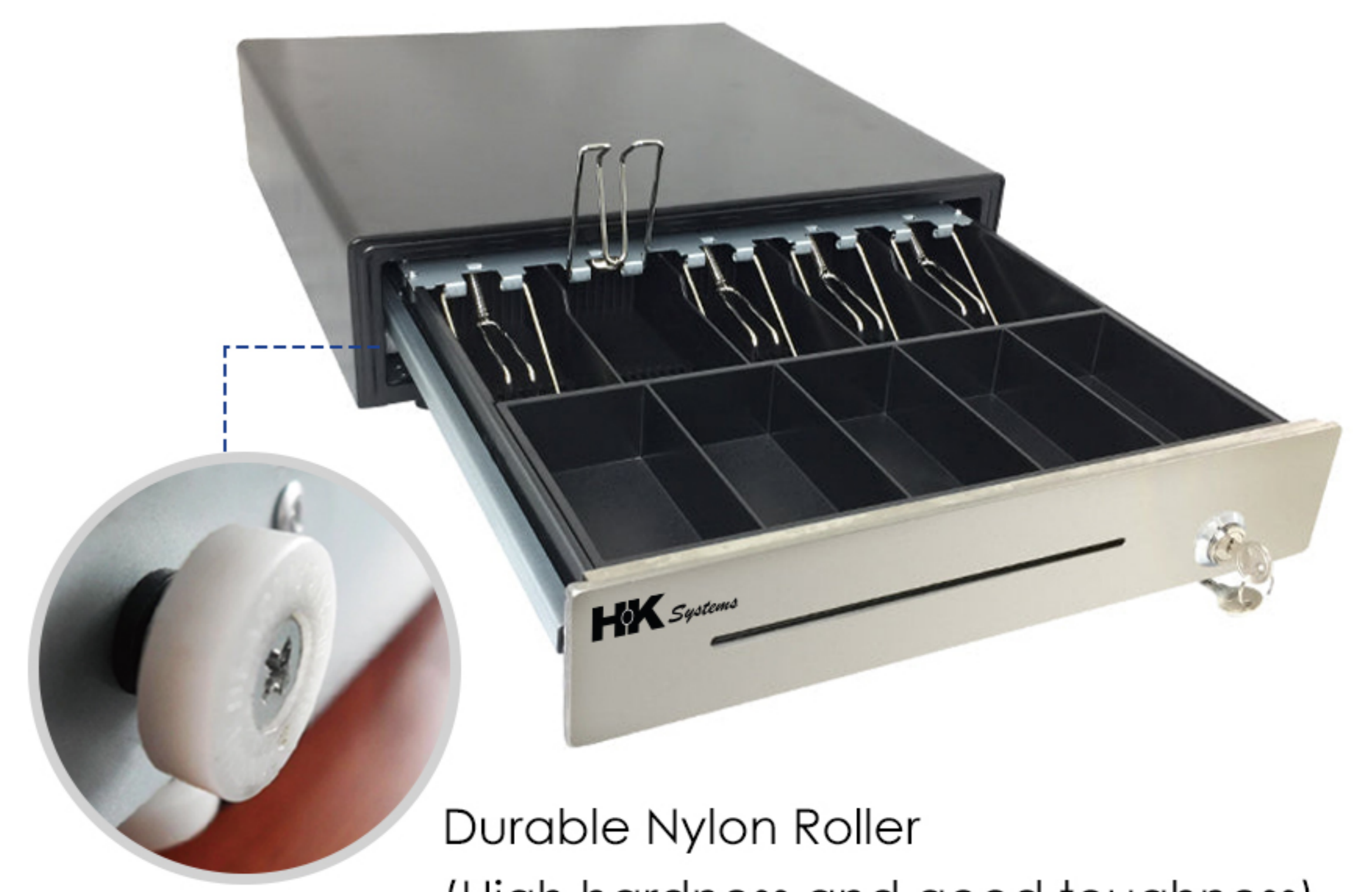
Durable Nylon Roller (High hardness and good toughness)

The load-bearing capacity exceeds 50KG. So it can bear heavy weight without any deformation even after long-term use.