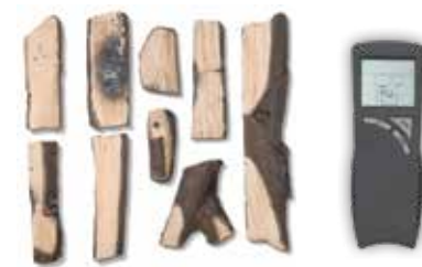
Abbot 30BL-Deluxe NG or LP

*For surrounds add between 5-20 lbs depending on the size of the unit.