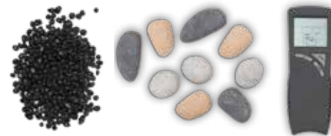
Abbot 30PG-Deluxe NG or LP