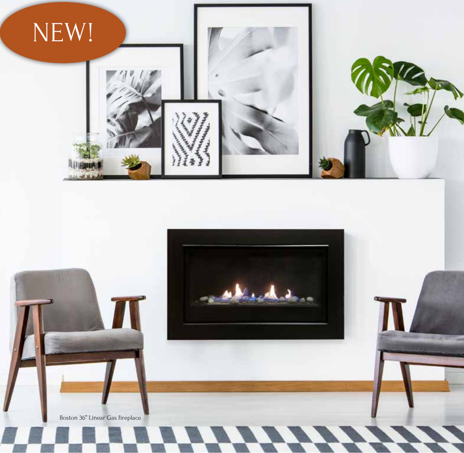
Boston 36" Linear Gas fireplace