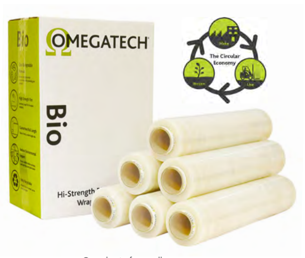
Our plastic-free pallet wrap.