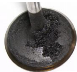
After just one Injector-Kleen 3000 Treatment