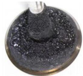
Before Injector-Kleen 3000 Treatment