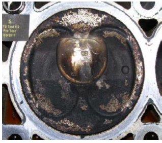
Before Injector-Kleen 3000 Treatment