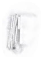
AC Power Adapter *1