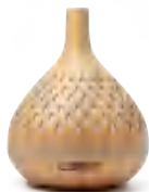
Diffuser * 1