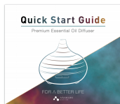
User Guide * 1