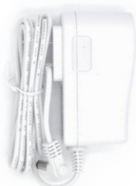
AC Power Adapter * 1