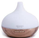
Diffuser * 1