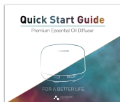
User Guide *1