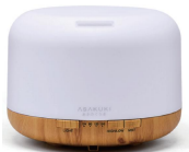
Diffuser * 1