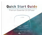
User Guide *1