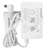
AC Power Adapter *1