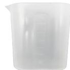
Measuring Cup *1