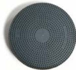
Pad holder for steel wool