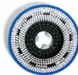
Soft scrub brush