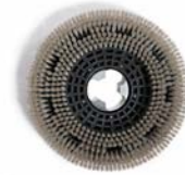
Hard scrub brush