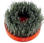
Aging brush floors Ø100-140