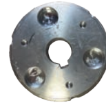
Tools holder Ø100-140mm B