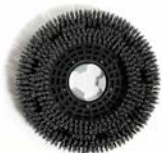
Tynex abrasive brush