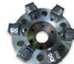
Disk bush hammer Ø400