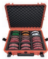
Kit luggy bag granite