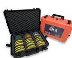
Kit luggy bag marble