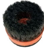
Steel brush Ø100-140