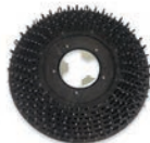
Steel spike brush Ø430