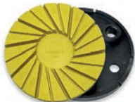
RM Ø100 -140