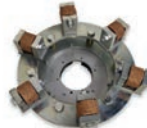
Disk bush hammer sandblaster Ø400