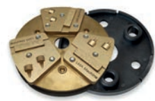
SSK TRIPLE Ø140