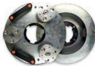
Gear plate Ø100