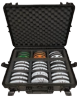
Kit luggy bag concrete