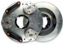
Gear Plate Ø 140