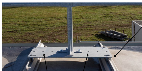
Universal base plate fits 24", 18", 16" & 12"

Base plate mounting holes allow for off-center attachment of the upright.