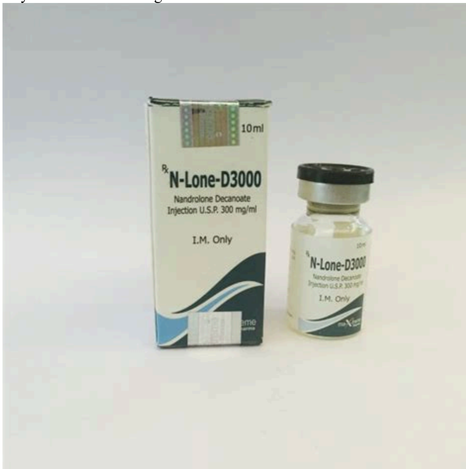
Test Deca Dbol Cycle -

Week 1-12: test e 500mg/wk Week 2-5: dbol oral 50mg/day Week 9-12: winstrol oral 50mg/day I've got a trip to Cabo in 13 weeks, so I want to have finished my cycle by then. I've seen some threads saying do winstrol weeks 11-14, but I don't have time for that, so will I be okay doing it on weeks 9-12? It went as follows: wk 1-12 test-e 500mg. wk 1-5 dbol 30mg ed. wk 10-14 Winstrol (winny) 50mg. wk 3-12 hcg 500iu ew. nolva pct. so yea extend Winstrol (winny) to 5 weeks, right up until pct. i like this cycle better because u stopped test at week 12 and continued with the Winstrol (winny) Spyder run it the way he has it and the hcg too.