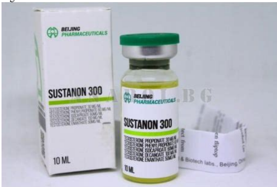
BOLDENONE 250 MAGNUS

Magnus Pharmaceuticals Boldenone 250 250mg / ml 10ml quantity. Add to cart. Category: Injectable steroids. Magnus Pharmaceuticals. Related products. DEBO TEST- 400. Rated 5.00 out of 5. Malay Tiger.