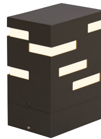
REVEL PATH shown in bronze

* Visit techlighting.com for specific warranty limitations and details.