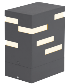
REVEL PATH shown in charcoal