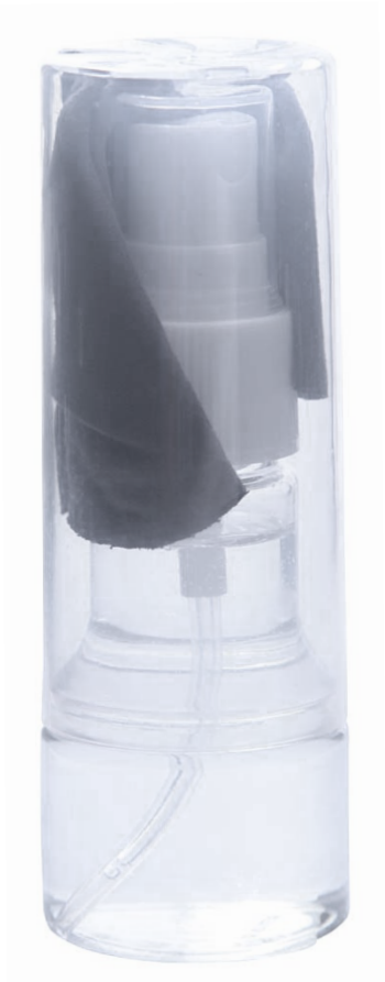
NOT TO SIZE. FOR PLACEMENT ONLY

THE DASHED LINE SHOWS THE MAXIMUM IMPRINT AREA AND DOES NOT PRINT.