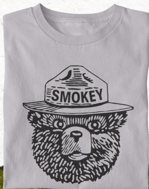
100% Combed & Ring-Spun